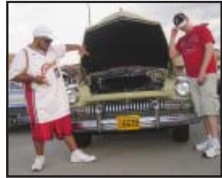
1951 Mercury and grill variety of cars, and they were particularly enamored of the chrome that cars used to have. Among the cars these two young men most admired were a 1958 Pontiac Star Chief with chrome all over the place, a '51 Mercury with a great big toothy chrome grill, a '47 Lincoln Continental whose owner popped the hood to allow these young ones to see a genuine V-12 motor for the first time in their lives, a '54 Corvette with a Blue Flame Six (who ever heard of a six cylinder Corvette?), and a '59 Chevy